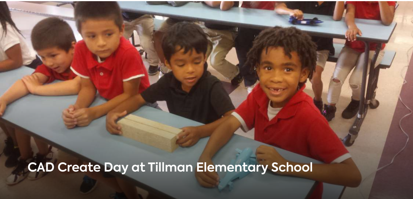
CAD Create Day at Tillman Elementary School

Our team is composed of five members from three schools in our county (Palmetto, Braden River, and Southeast High School). Each of our members provides distinct skills which contribute to the overall competence of the team. By hosting CAD Create days at local elementary and middle schools, our team will introduce the community's youth to various computer design softwares which we used throughout the course of our project. We will show students the untapped potential of these programs and the astonishing things they can create in these programs, and discuss the wide scope of careers available to those who learn these softwares. Through these initiatives, our team will foster a passion for STEAM at a young age.