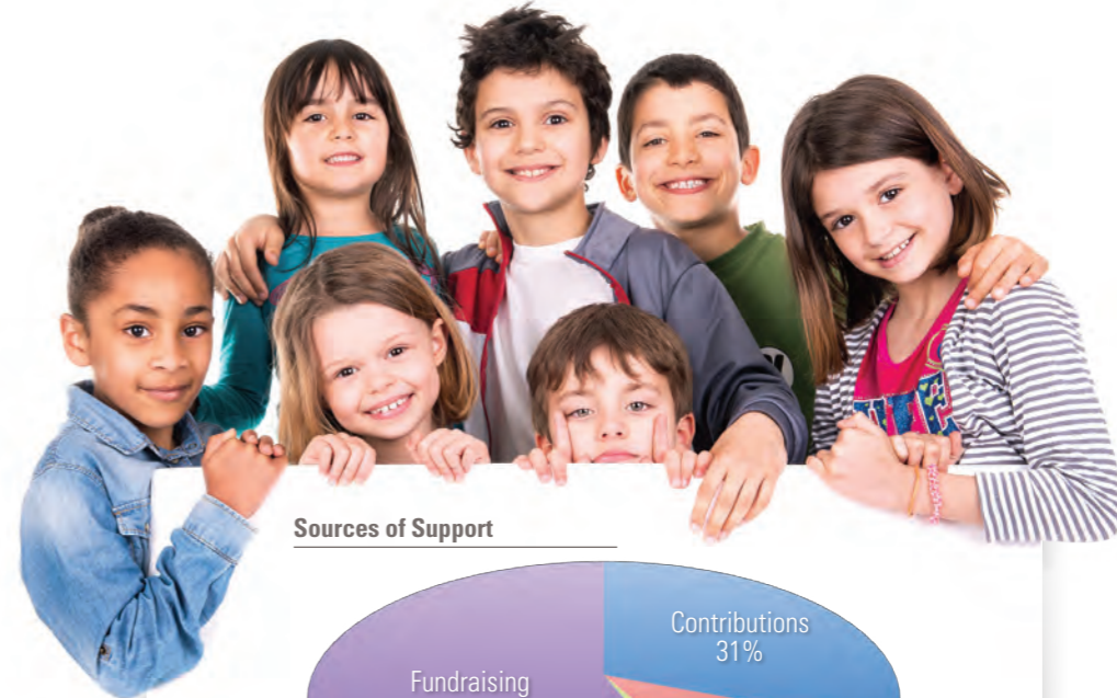
Sources of Support